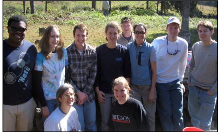
The team of Episcopal and Catholic students at the St. Andrew's Woodleaf cemetery workday in November.

A group from the Davidson College Catholic Campus Ministry and the Canterbury Episcopal Campus Ministry joined the McCoy family at St. Andrew's Episcopal Church in Woodleaf, NC on November 6. We participated in our third workday at the parish's cemetery. The parish, founded in 1840, has a cemetery in which both white and black parishioners were buried during the time of slavery. We are working with descendants of the founders of the parish to restore the graveyard, ultimately to have it reconsecrated by Bishop Curry. The team worked hard pulling weeds, clipping brush, and felling cedar trees. The students certainly enjoyed the opportunity to get outside and do some work that engaged their bodies as well as their minds!