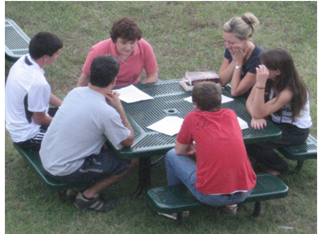
Youth in conversation with their mentors during confirmation.