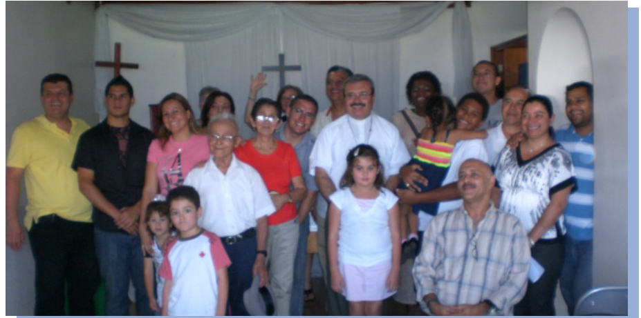
Greetings from Cristo Resucitado!

We have high hopes for a great year for all ages and look forward to seeing everyone in September!